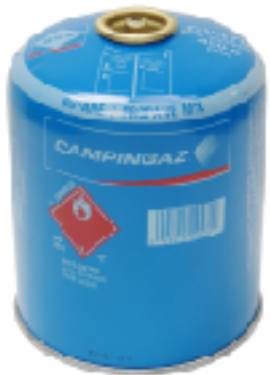
PROPANE/BUTANE Camping GAZ® CV-470 / CV-270