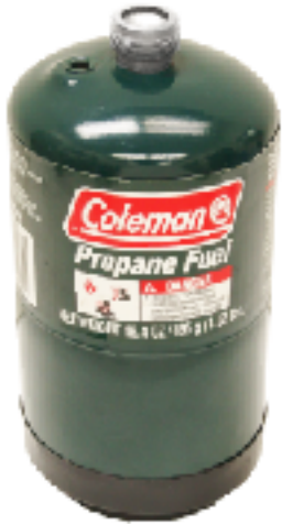
PROPANE DOT-39 NRC 228/286