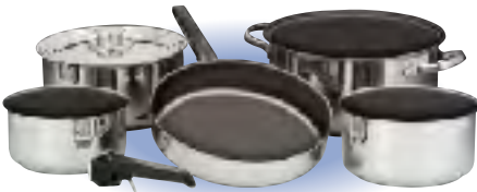
Stainless steel with DuPont Teflon® Select Non-Stick finish.