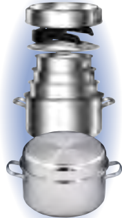
"Nest" in less than 1/2 cubic foot

See our website for other quality Magma accessories