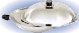
100% All 18-8 Stainless Steel Wok