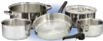
Stainless steel finish.